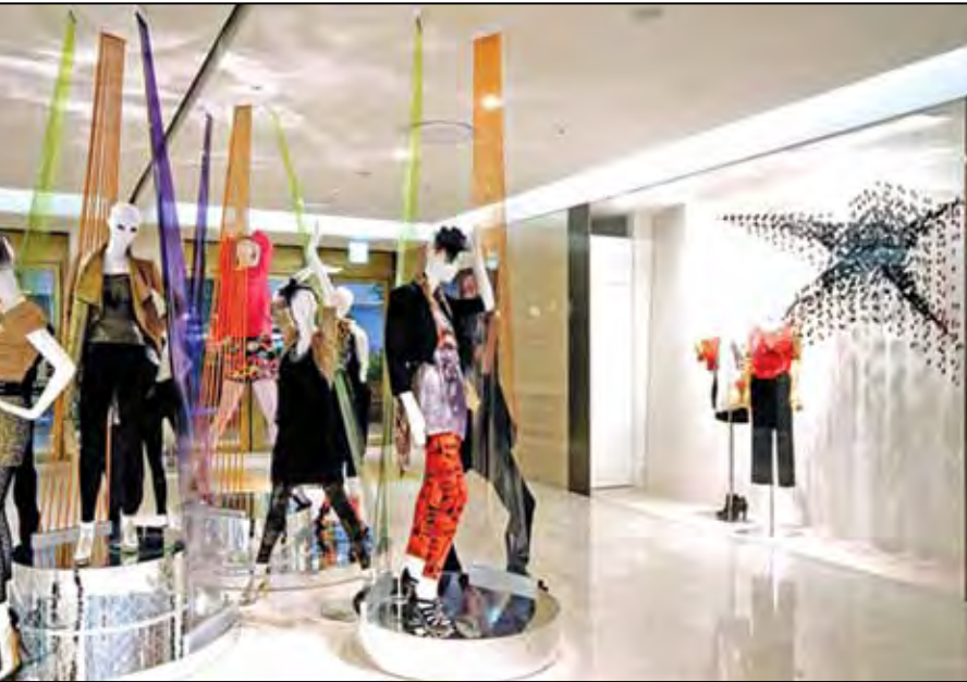
Lotte Design Division, Seoul