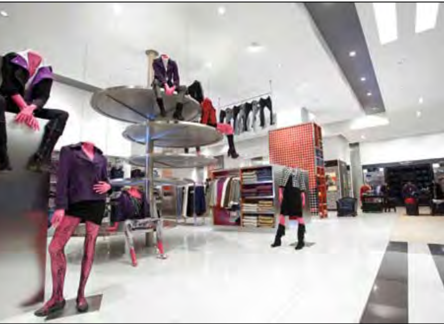
FRCH Design Worldwide, Cincinnati